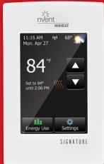
nVent NUHEAT Signature thermostat

Control your line voltage electrical heating system with nVent NUHEAT's premium range of controllers.