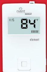
nVent NUHEAT Element thermostat

Our family of thermostats are designed exclusively by nVent NUHEAT to be easy to use and energy efficient, while fitting in with any modern home decor.